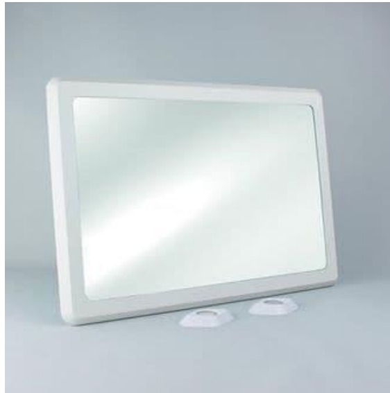
Mirror – type 515 - £817.95