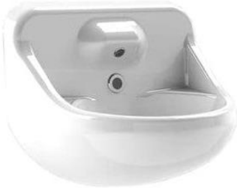
Type*030 – £830.95 + vat Type*039 – £812.95 + vat