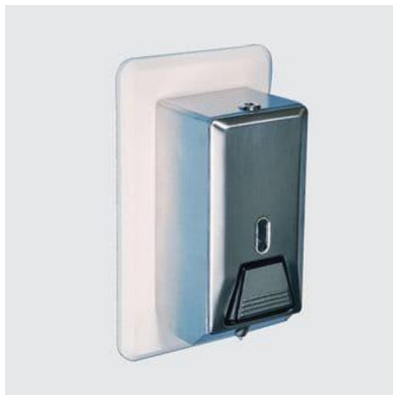
Soap Dispenser – type 510 - £668.95