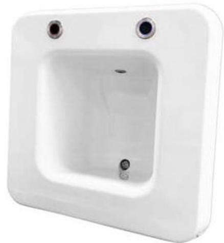
Type*084 – £651.95 + vat