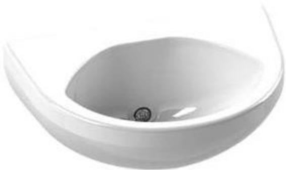
Type*080 – £1052.95 + vat Type*081 – £605.95 + vat