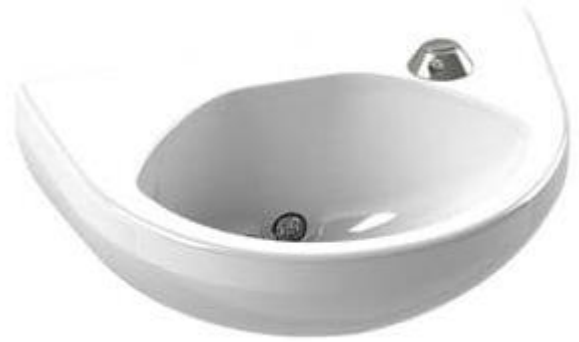
Type*082 – £628.95 + vat